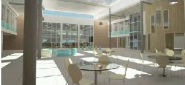
Indicative images and suggested finishes for new learning space and sixth form block Verulam School, St Albans, Herts